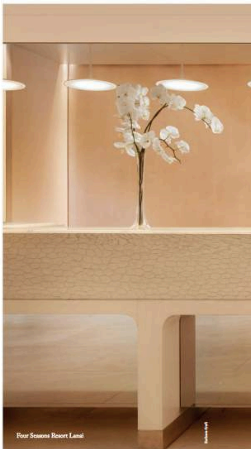
Four Seasons Resort Lanai

W e live in the most efficient, least disease-ridden time in recorded history, yet we still don't feel all that well. We require much more than a deep-tissue massage and cleansing facial to restore us. The latest and greatest destination-driven retreats are fulfilling our needs with natural resources to promote total wellness, and the facilities, experts, and programming to repair what ails us. Whether it's reconnecting to nature, depriving the senses to gain focus, or meditating for elevated lucidity, getting out of our heads and into the right hands is vital to living our best lives. »